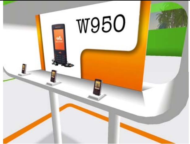
Example 2: 3-D product placement: Sony Ericsson W950 mobile phone