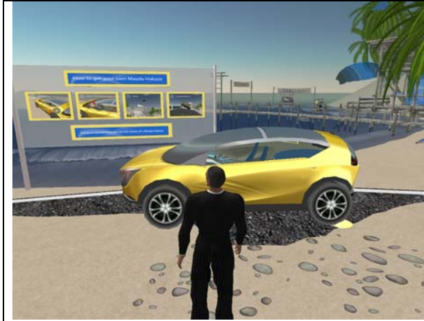
Example 1: 3-D product placement: the Mazda Hakaze