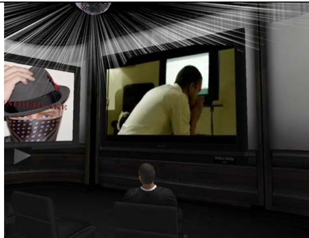
Example 3: Rich multimedia advertising and video for Justin Timberlake album (Sony BMG)