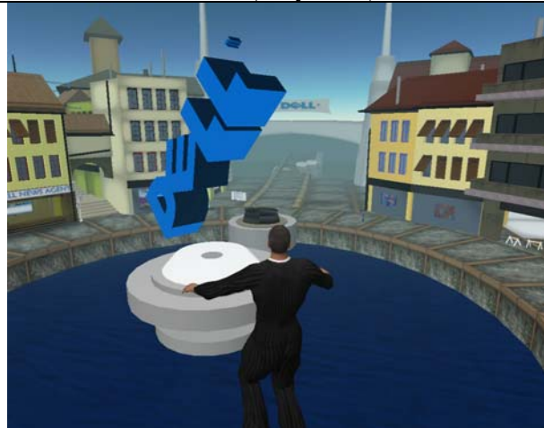
Example 5: Themed island for Dell Computers