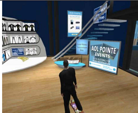
Example 6: Themed island for AOL