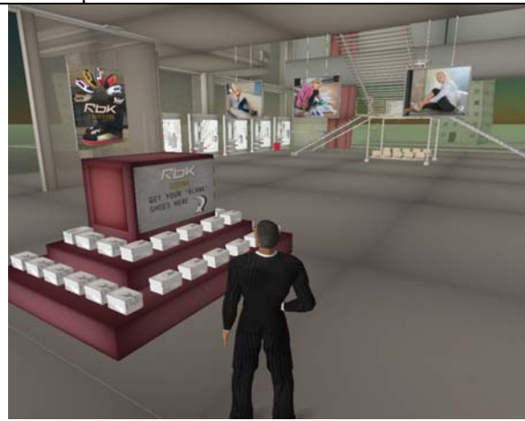
Example 4: Personalization of 3-D products: Reebok shoes